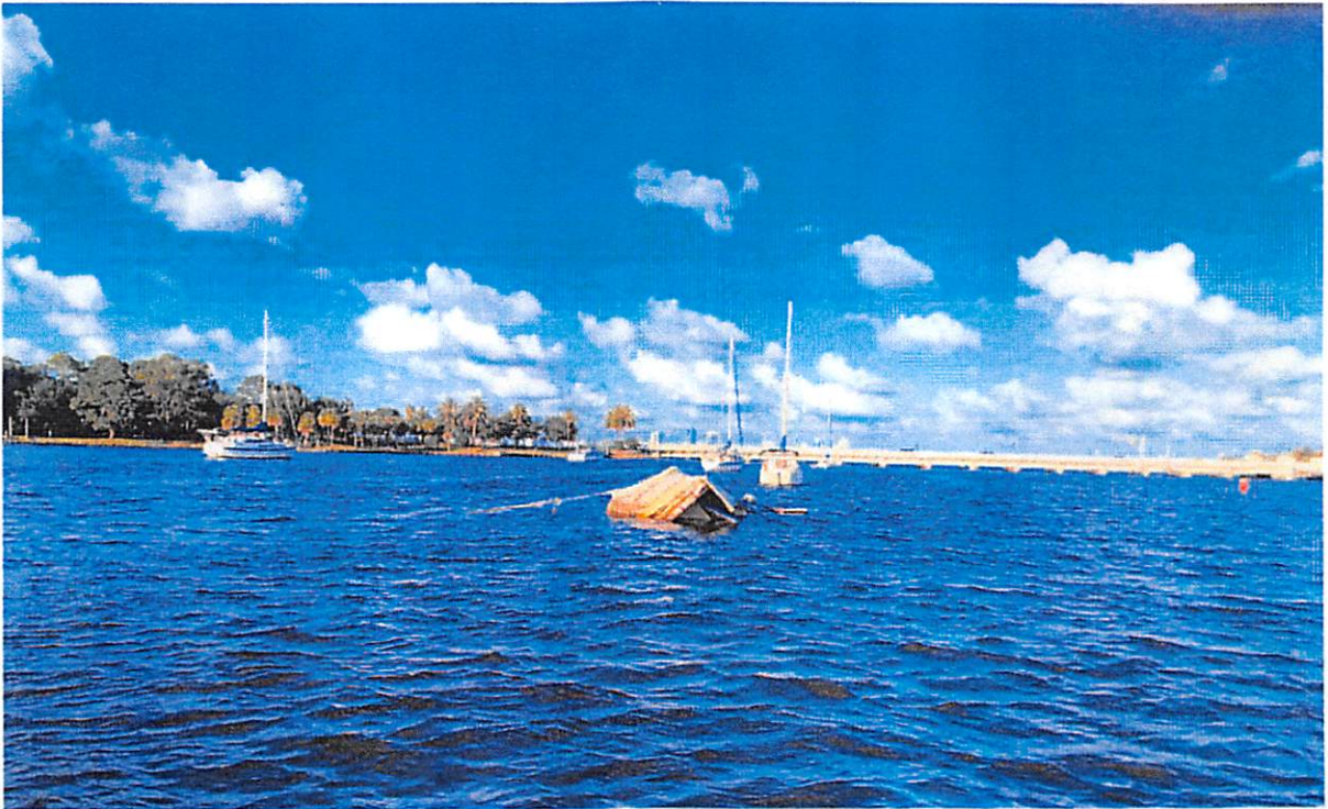
The "floating structure" in the Ortega River September 29, 2019