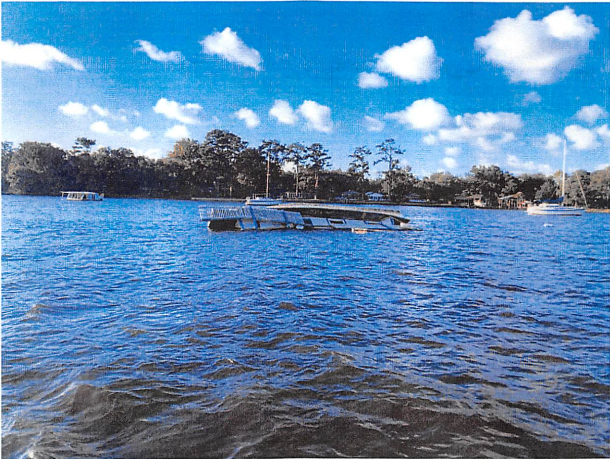
Derelict vessel in the background and "floating structure" in the foreground September 29, 2019