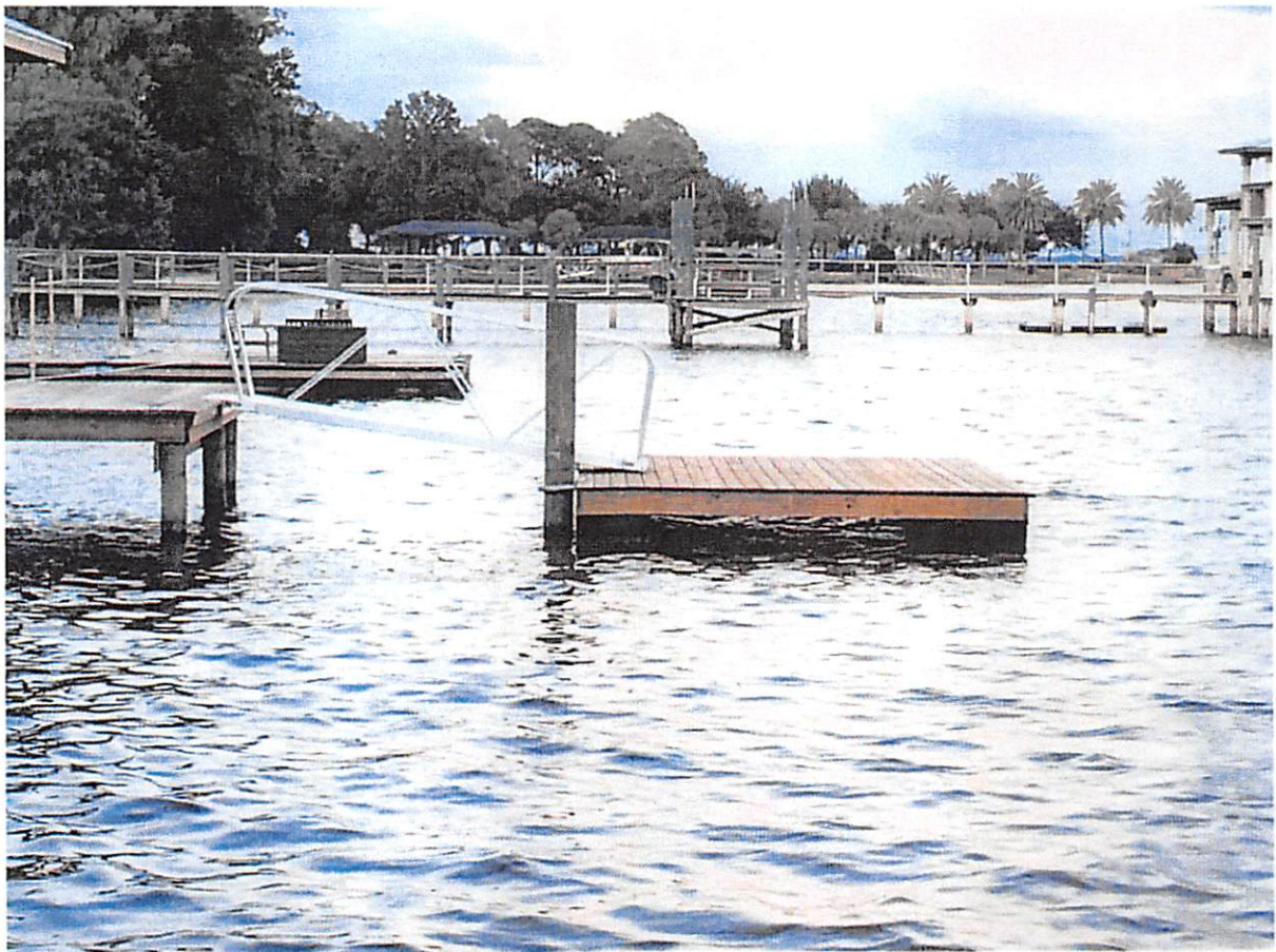
A floating structure as part of a dock